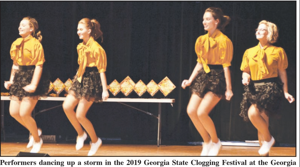
Mountain Fairgrounds on Saturday.