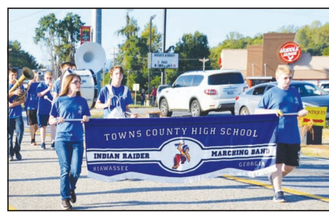
The Towns County High School Indian Raider Marching Band in the Oct. 3 Homecoming Parade through Downtown

returning parade was very fitting: "There's No Place Like Homecoming.